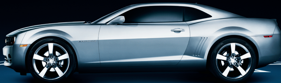
Camaro 1LT in Silver Ice Metallic. Shown with available RS Package and polished-aluminum wheels.

Some standard content may be deleted with fleet orders. See dealer for details.